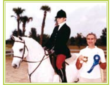
Al Fustat (Ansata El Naseri x *Walaa)

Ansata El Naseri was an ideal example of 'form to function.' He consistently produced excellent performance horses, and his offspring were often athletic and versatile, easy to train, and exceptional movers. His daughter Glenglade Zelda (x *Lancer's Zeina, by Kayed) had park-like motion under saddle. His straight Egyptian son Al Fustat (x *Walaa, by Wahag) won English Pleasure and Hunter Under Saddle classes in Florida. Al Fustat was exported to South America, where he became an impressive dressage exhibition horse.