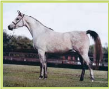
Left: El Sharie (Ansata El Naseri x *Sharara, by Kayed) Below: Shadenn (Shaikh Al Badi x El Sharie, by Ansata El Naseri)