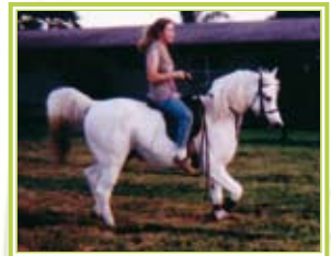
Indrio, by Ansata El Naseri

Ansata El Naseri sired several very good Egyptian-sired purebreds including the pretty, balanced, and substantial mare *GG Kheepsake, who competed successfully in Western Pleasure in Florida before being exported to Brazil, where she became a valuable broodmare. Ansata El Naseri also sired the small but extremely typey and fantastic moving purebred gelding Indrio. Indrio's motion topped even Glenglade Zelda's, and his performances made many spectators smile.